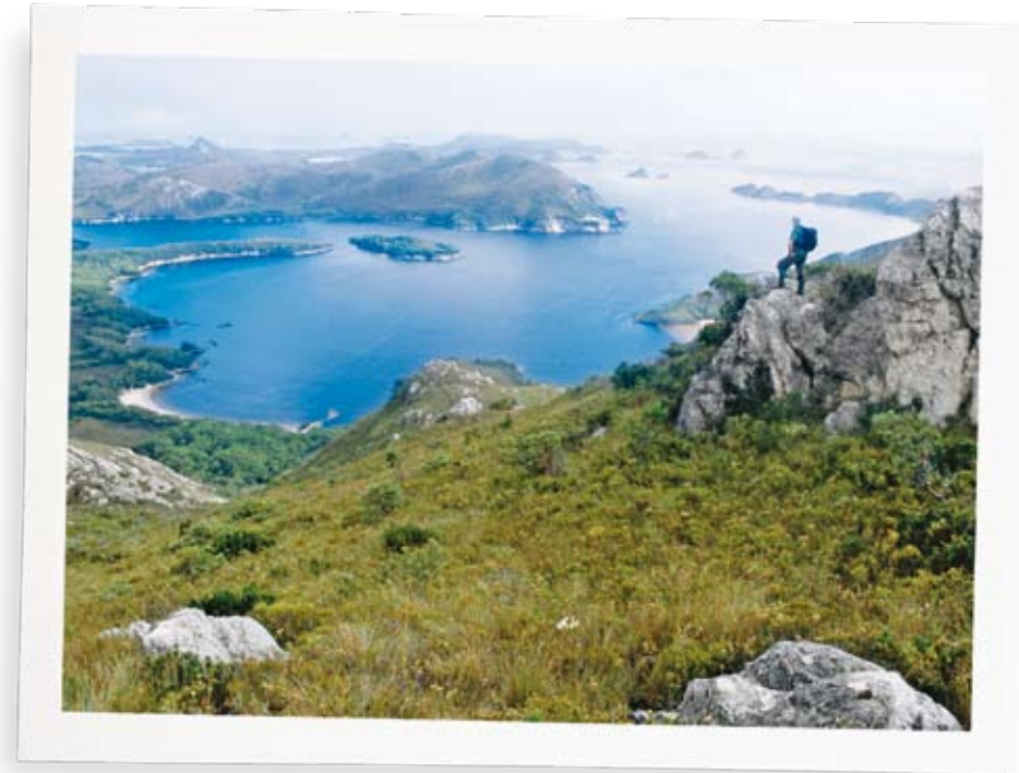
Roaring 40s kayaking takes place at Breaksea Island, TAS, seen here from Mount Stokes.