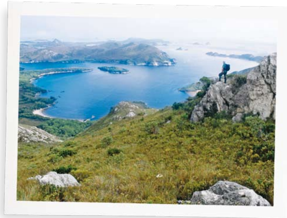
Roaring 40s kayaking takes place at Breaksea Island, TAS, seen here from Mount Stokes.